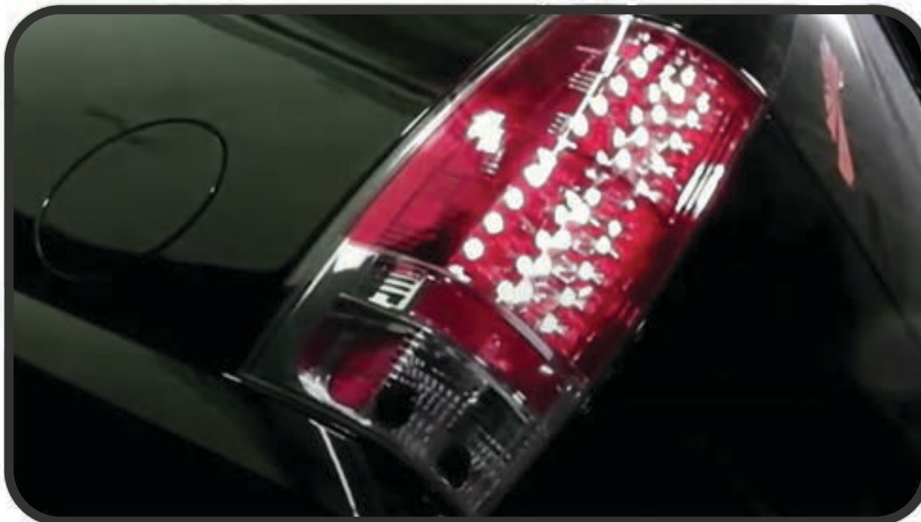
STEP 9: RECONNECT THE BATTERY AND TEST THE FUNCTIONS TO ENSURE THEY FUNCTION PROPERLY