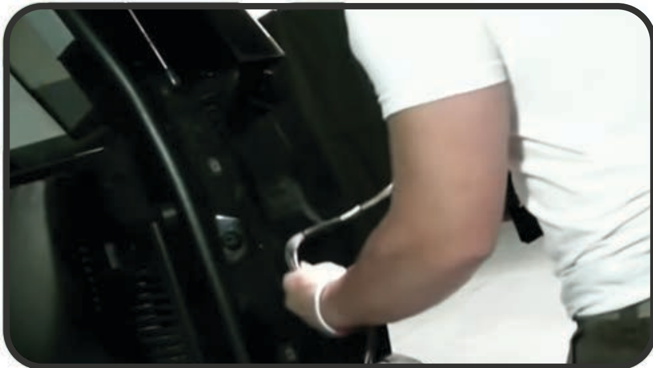
STEP 6: FEED IN THE SPYDER TAIL LIGHT HARNESS