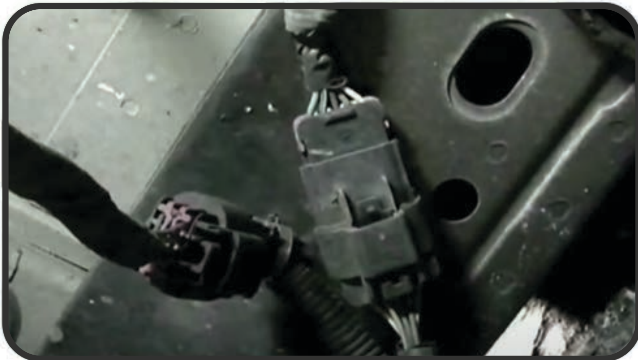
STEP 8: CONNECT THE SPYDER TAIL LIGHT HARNESS