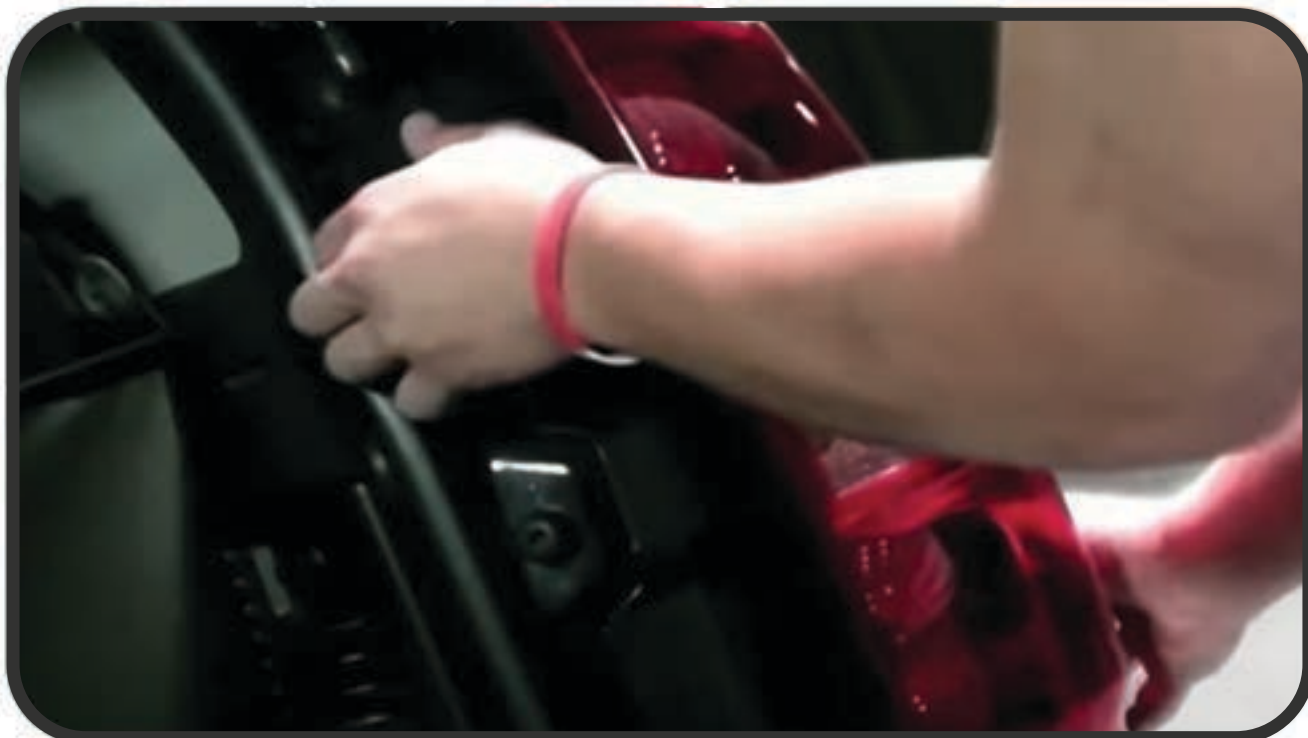
STEP 4: UNSEAT THE TAIL LIGHT