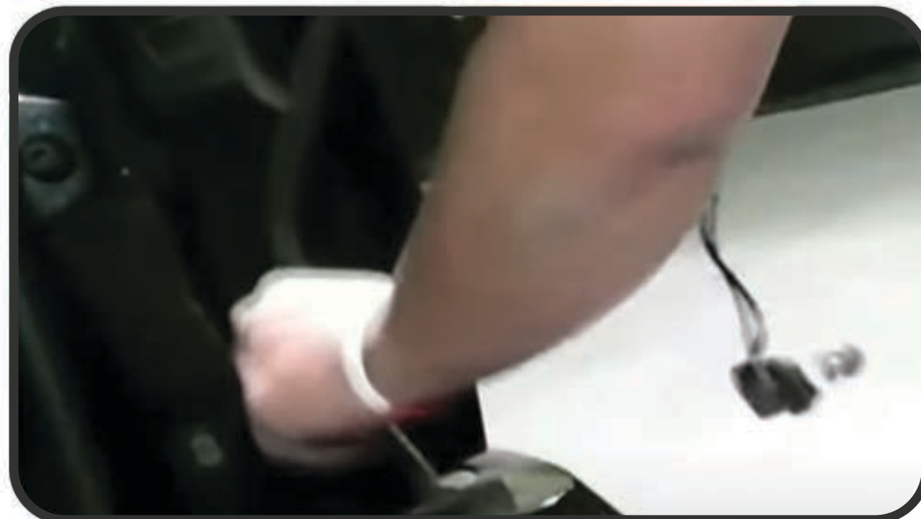
STEP 5: REMOVE THE FACTORY HARNESS