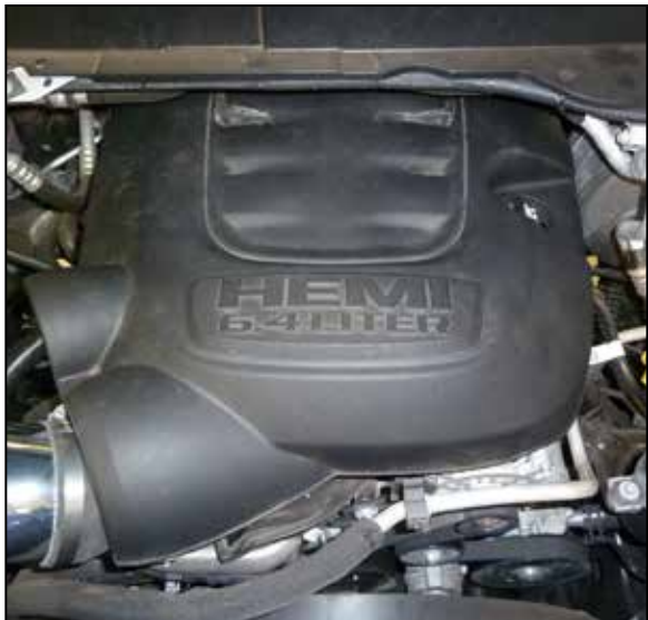
19. Reinstall the engine cover.