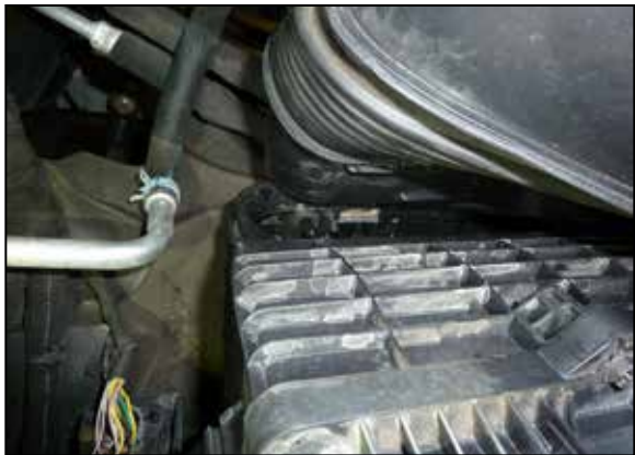
5. Disconnect the fresh air intake duct from the factory air filter housing