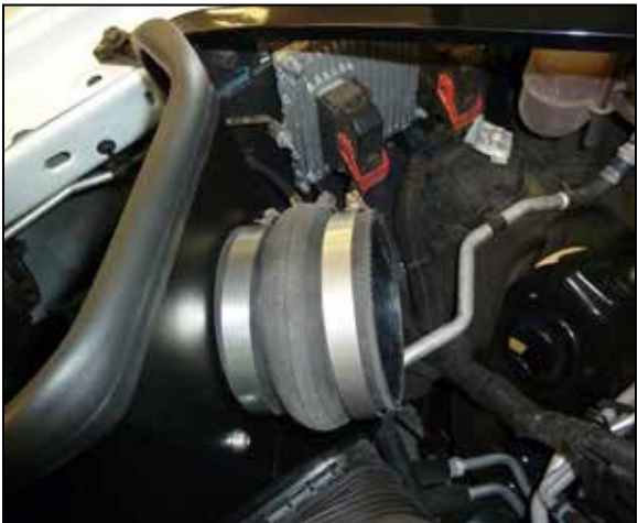
12. Install the provided hump coupler onto the filter adapter and secure with the provided hose clamp.