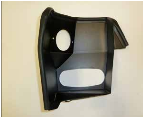
7. Install the provided edge trim onto the K&N heat shield as shown.