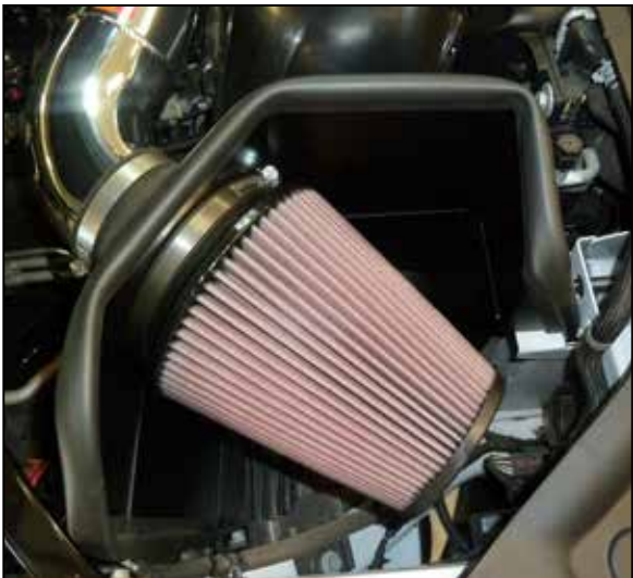
20. Install the K&N air filter and secure with the provided hose clamp.