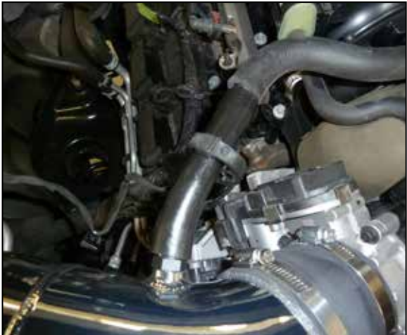
17. Remove the short section of the factory CCV hose and install the straight section provided. Connect the CCV hose to the fitting installed into the K&N intake tube.