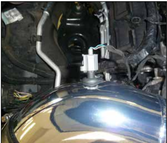
18. Reconnect the IAT sensor electrical connection.