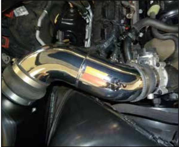
16. Install the intake tube into the couplers, position for best fit and then secure with the provided hose clamps.