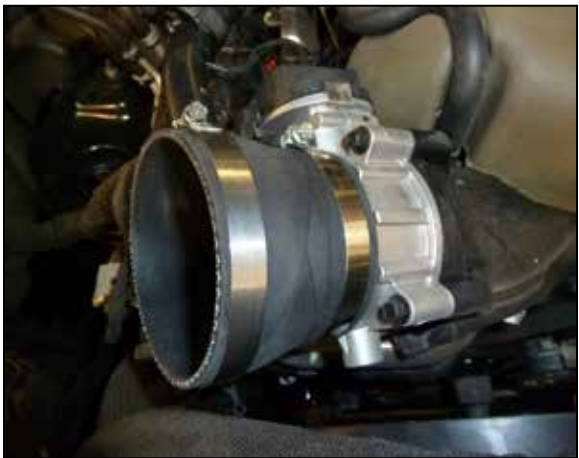
13. Install the step coupler onto the throttle body and secure with the provided hardware.