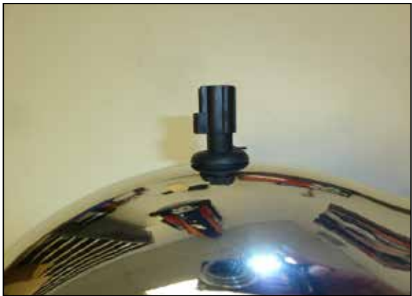
15. Remove the IAT sensor from the factory intake tube and then remove the O-Ring from the sensor. Using the provided grommet, install the sensor into the K&N intake tube as shown. NOTE: The IAT sensor is very fragile, use caution while handling the sensor so as not to damage it.