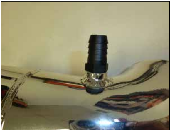
14. Install the provided vent fitting into the K&N intake tube as shown. NOTE: NPT fitting has tapered threads and only designed to be installed until hand tight, then tighten one rotation or when the fitting becomes difficult to return.