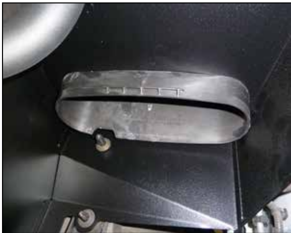
11. Insert the fresh air intake duct into the K&N heat shield.