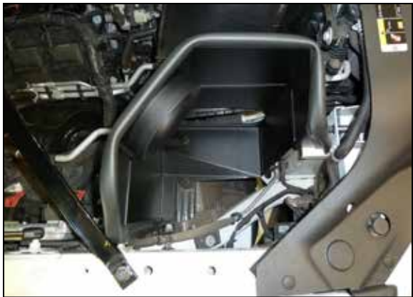
10. Install the K&N heat shield into the vehicle.