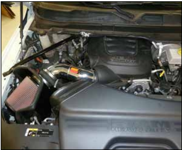
21. Reconnect the vehicle's negative battery cable. Double check to make sure everything is tight and properly positioned before starting the vehicle.

22. It will be necessary for all K&N® high flow intake systems to be checked periodically for realignment, clearance and tightening of all connections. Failure to follow the above instructions or proper maintenance may void warranty.