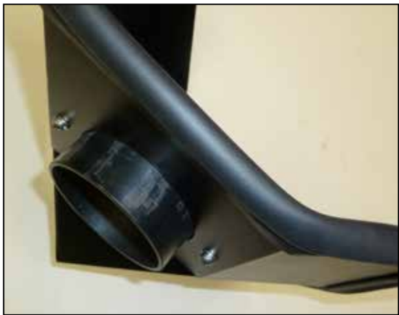
8. Install the filter adapter into the heat shield and secure with the provided hardware.