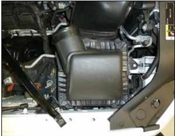
6. Pull the factory air filter housing straight up and remove it from the vehicle. NOTE: K&N Engineering, Inc., recommends that customers do not discard factory air intake.