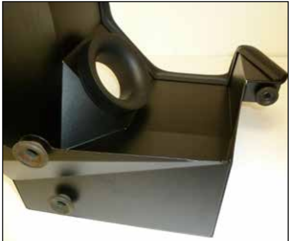
9. Remove the three mounting grommets from the factory air filter housing and install them into the K&N heat shield as shown.