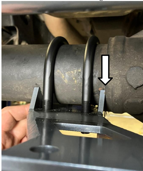
Figure 3. Dual Stabilizer Bracket Indexed on the Differential Housing