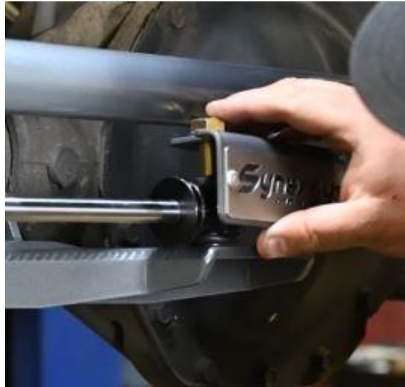
Figure 4. Partially Installed Stabilizers on Synergy MFG Bracket