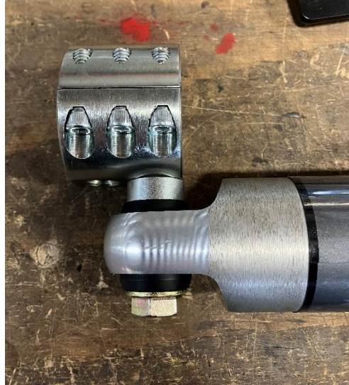
Figure 6. 4050-50 Clamp Installed on Steering Stabilizer.