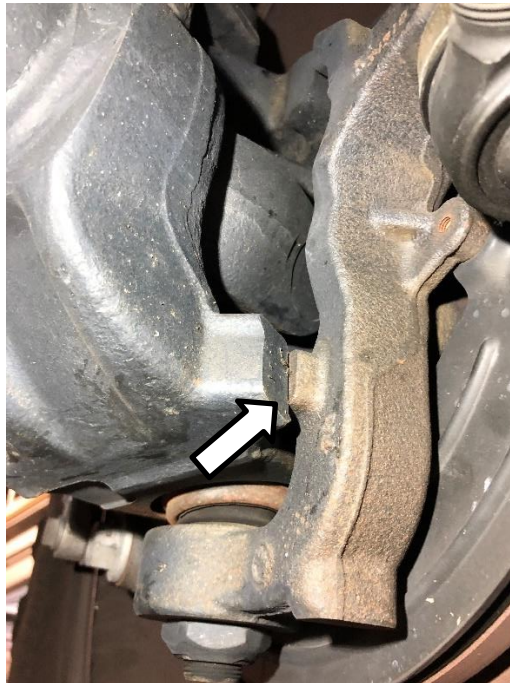
Figure 5. Driver Side Knuckle Fully Turned to the Passenger Side, Contacting the Steering Stop