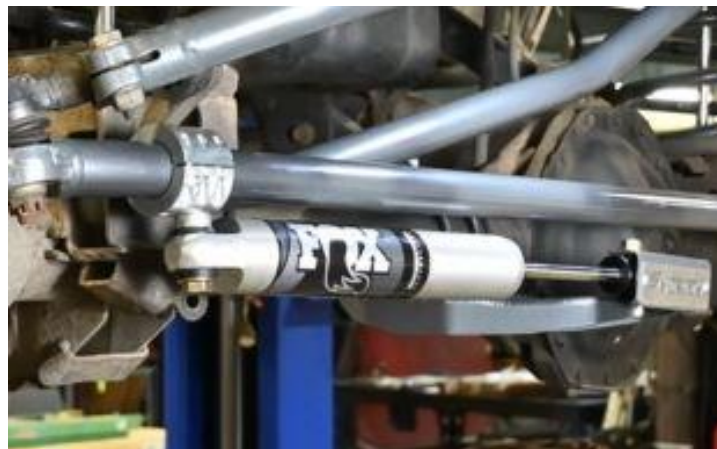
Figure 7. Correctly Installed Stabilizer