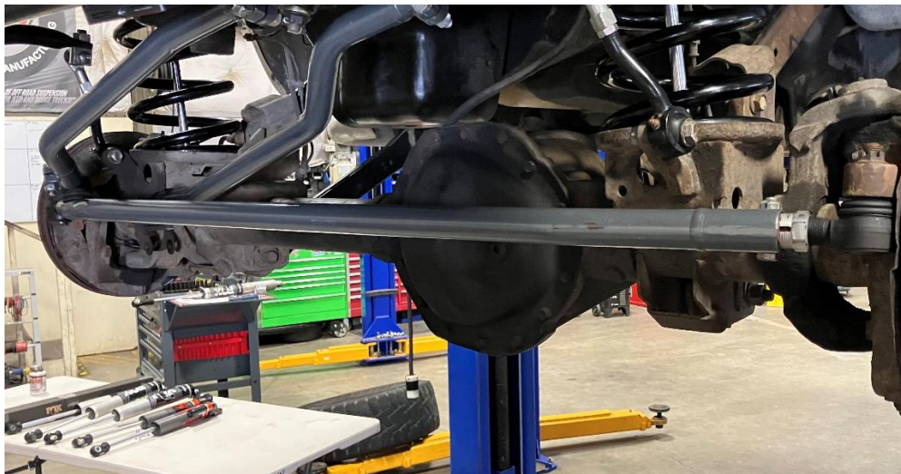
Figure 1. Steering Assembly with Stabilizer Removed.