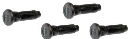
Backing Plate Anchor Bolts