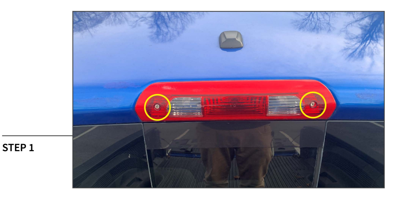
Remove (2) Phillips head screws from the third brake light assembly.