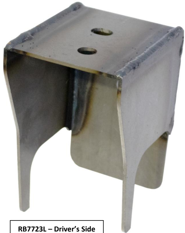
RB7723L – Driver's Side