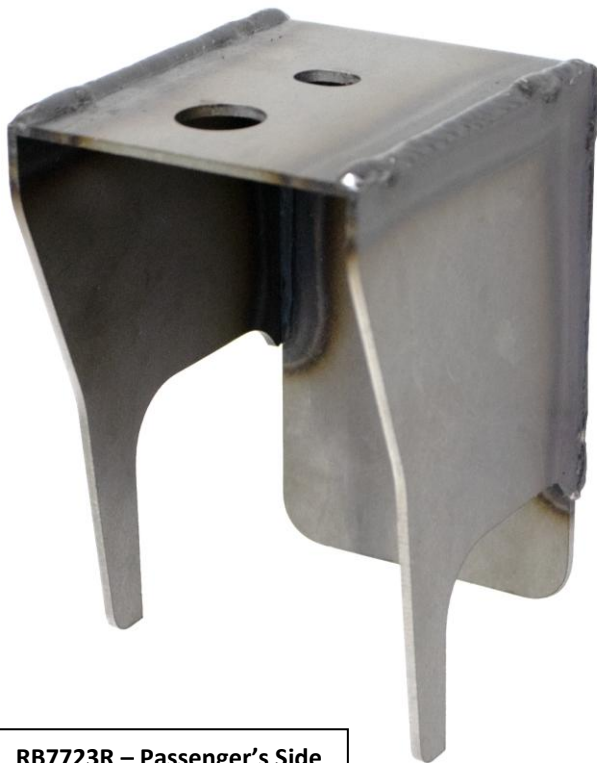
RB7723R – Passenger's Side