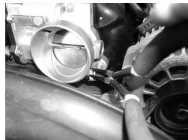
Removal Step 5