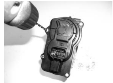
Assembly Step 1

Step 7 Start your engine and let it idle completely uninterrupted for approx. 20 minutes before driving. This will give the engine management computer time to adapt to the BBK throttle body at normal operating temperatures.