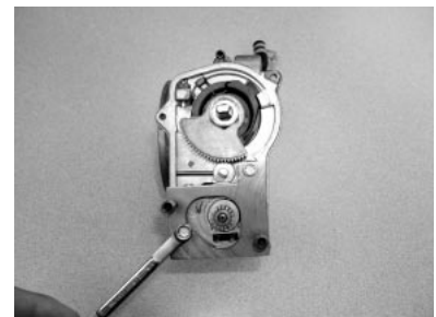
Assembly Step 5