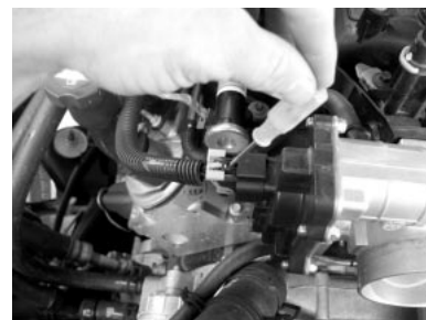
Removal Step 4