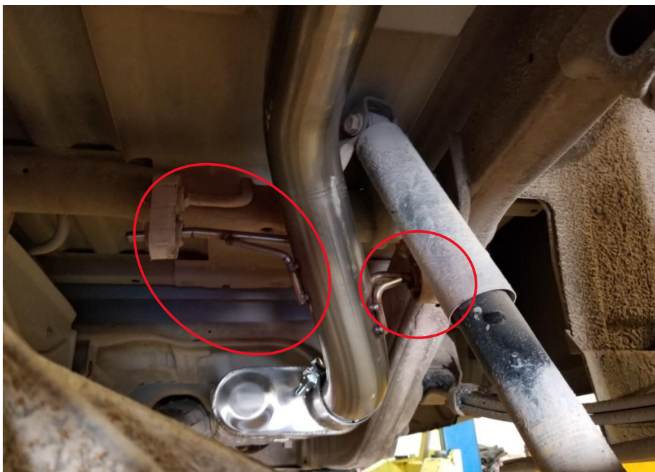
Figure 3 – Before Axle Tube

For the ToughTruck System install the muffler delete tube included with the kit onto the flare tube outlet with clamp. Make sure to tighten clamps until they are snug NOT tight.