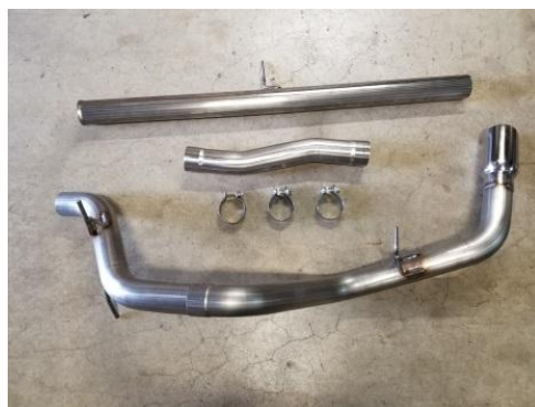
Part # 92T105