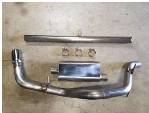
Part # 92T110