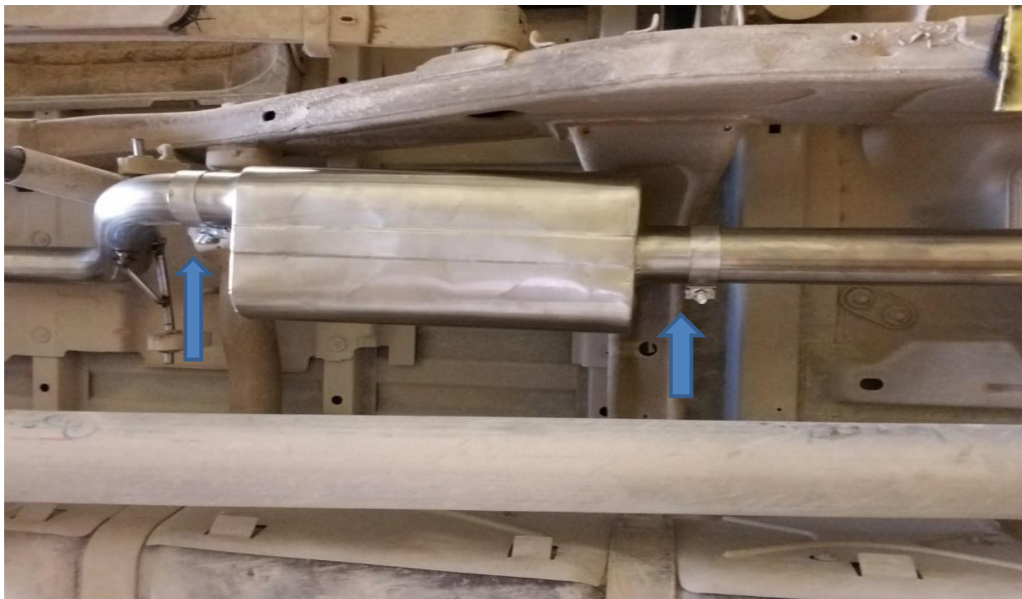
(Figure 2) Muffler orientation

Step 1 - Locate MRT flared tube. It is the longest piece of the kit. Install flared tube with flared end over the downpipe outlet with provided clamp. Tighten clamp until snug but not tight. Final tightening will be conducted once the system is fully positioned.