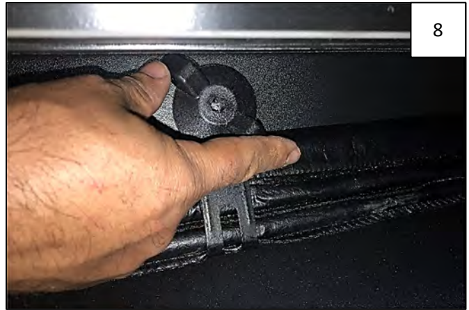
Nest jack tools in driver side of the Underseat Storage Box (against rear of box) and reinstall knob removed in Step 5.