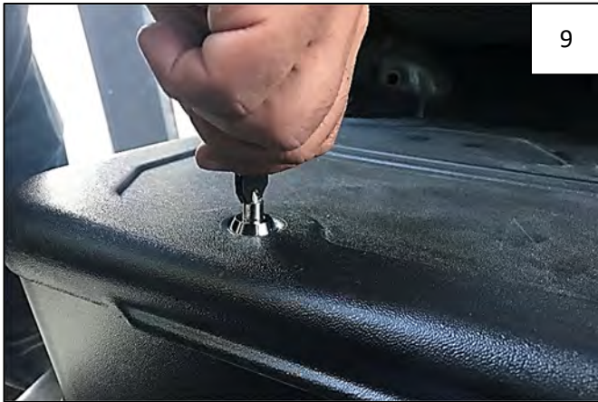
Close the lid of the UnderSeat Storage Box, and lock each lock with pair of keys.