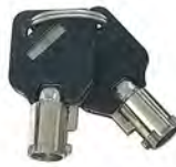
Set of Keys 1 pr