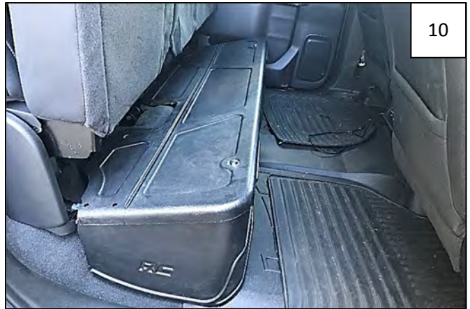
Underseat Storage Box installation is complete. Lower seat into place.