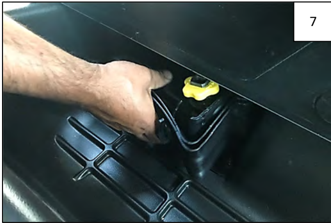
Reinstall jack onto jack plate.