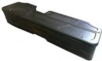
Underseat Storage Box with Lid 1 pc