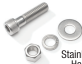
Stainless Steel Hardware (Available only with the BumpStep®XL with Theft Deterrent Stainless Hardware)