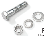
Plated Hardware (Available only with the BumpStep®XL with Plated Hardware)