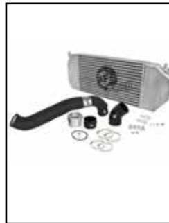
Intercooler w/ Tube