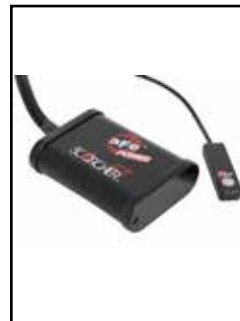
SCORCHER GT Module

P/N: 49-43045-B (Blk. Tips) 49-43045-P (Pol. Tips)