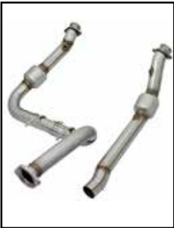
Twisted Steel Downpipes

P/N: 48-43020-HC (Street) 48-43020-HN (Race)