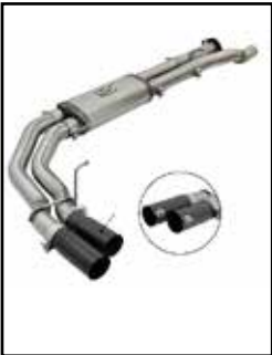
Side Exit Exhaust System

P/N: 49-43091-B (Blk. Tips) 49-43091-P (Pol. Tips)