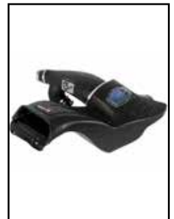
Momentum GT Air Intake

P/N: 51-73115 (PDS) 54-73115 (P5R) 75-73115 (PG7)