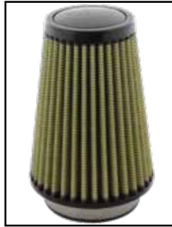
Pro-GUARD 7 Air Filter