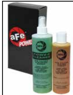
Pro-GUARD 7 Restore Kit