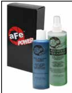
Pro 5R Restoe Kit