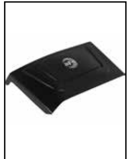
Intake System Cover