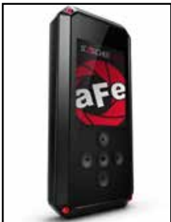
SCORCHER PRO Tune