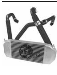
Intercooler w/ Tubes