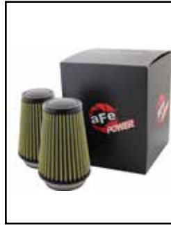
Pro-GUARD 7 Air Filters