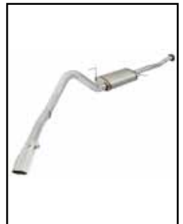
Exhaust Cat-Back System

P/N: 49-43068-B (Blk. Tip) 49-43068-P (Pol. Tip)