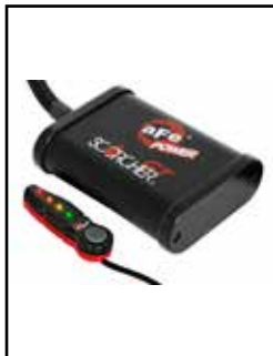
SCORCHER GT Module