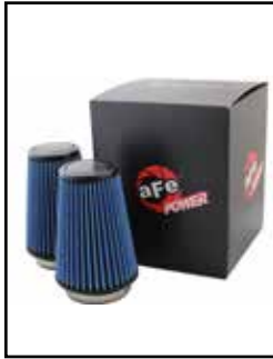
Pro 5R Air Filters